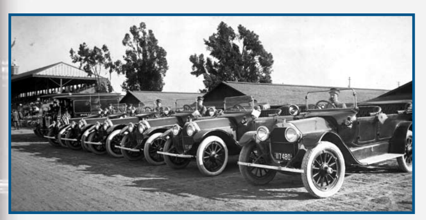
Vintage 1929 Buicks with the first electric patrol wagon, circa 1904 (far left).

Two-wheeled transportation entered the picture in 1900, when bicycles were utilized to decrease response time. Five years later, the first motorcycles, Indians, were acquired, and in between, the