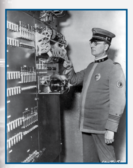
An officer in the traditional summer wool uniform

Throughout time, the uniform has endured a number of changes. Some were born of tragedy and necessity, and some for comfort, but one constant distinguishes the LAPD: the classy dark blue uniforms. The color is emblematic of not just a great