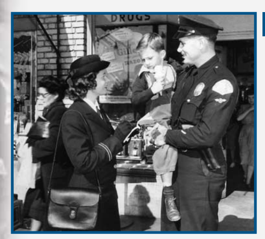
A policewoman, wearing the first formal LAPD uniform for females, queries a young boy.