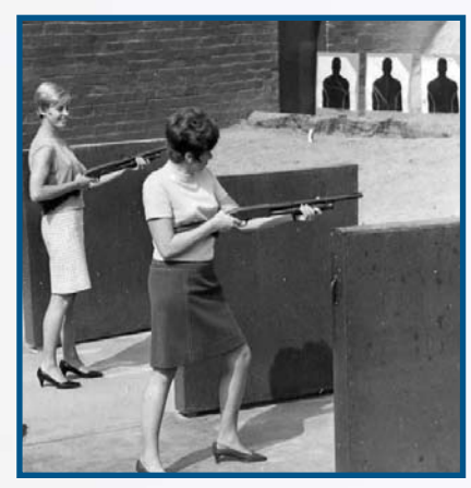
Policewomen practice their skills on the shotgun range in the 1960s.

Although there is evidence that formal training for Policewomen started in 1940, the first acknowledged class of Policewomen graduated from the Elysian Park Academy in 1946. Classes were generally small and segregated by gender; policemen trained separately. Graduating policewomen largely carried out their work without a