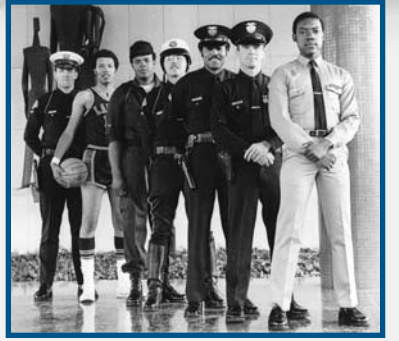
A variety of uniforms worn by the Department in 1972.

The uniform most similar to the current version arrived in 1940. The equipment belt was supported by a cross strap, and the hats were of the eight-point variety. The uniform buttons were gold toned, and no nametags were worn. Ties were required, and the shirts only came in long sleeves. Otherwise, the uniform was very similar to today's version. White hats for traffic officers were adopted in 1950, and the cross-strap for the equipment belt was dropped in 1958. Nametags were added at the end of 1965. Rank insignia was expanded with the adoption of the career police plan in 1971, leading to the chevrons of FTOs, SLOs and Sergeants II on uniform sleeves.