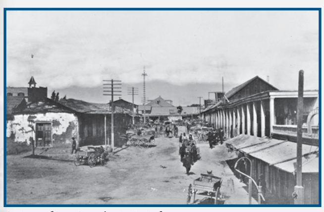
A view of Los Angeles in its infancy.

The population had swelled to 5,000, and no longer could a city marshal alone police the four square leagues without assistance. Public drunkenness and a soaring murder rate pushed the city fathers to confront a dilemma of criminality. A paid police force was born. Silver, eight-pointed stars were pinned to the dusters and duds of the first six to serve, their spurs and saddles complementing the lever-action Winchesters of the first known LAPD.