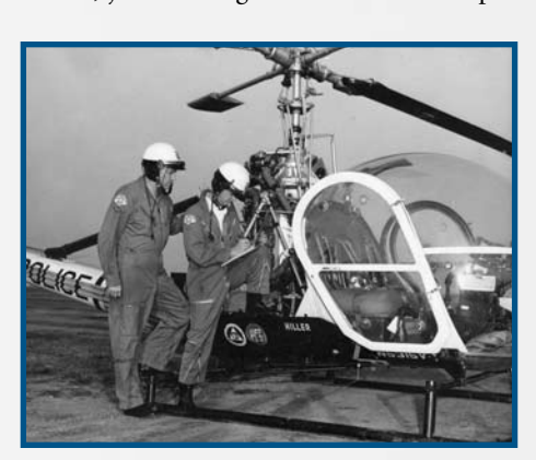
The Hiller Airship, first used in the 1950s.

Indians, were acquired, and in between, the Department's first motorized vehicle, a 1904 electric patrol wagon was purchased. This vehicle, which travelled at a swift eight miles per hour, doubled as an ambulance, but had no brakes. It was the responsibility of the passenger officer to bring the wagon to a halt in the event the driver was not able to slow the vehicle to a stop. Ten years later, the Flying Squad was founded. Planes weren't involved, just touring cars utilized for rapid