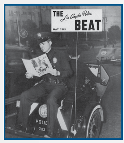
An officer receives a ride around town while reading an early copy of The Police Beat magazine.

Of the resources held at the Historical Society, one of the most useful is the collection of annual reports. Either photocopies or actual reports are held on-site dating back to 1895. The earliest ones are scarce, but once they date into the 1911 and beyond, the holdings are nearly complete. Many of these early publications contained a full listing of